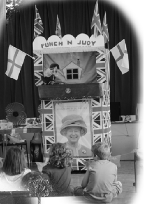
Punch & Judy West Lavington Village Hall