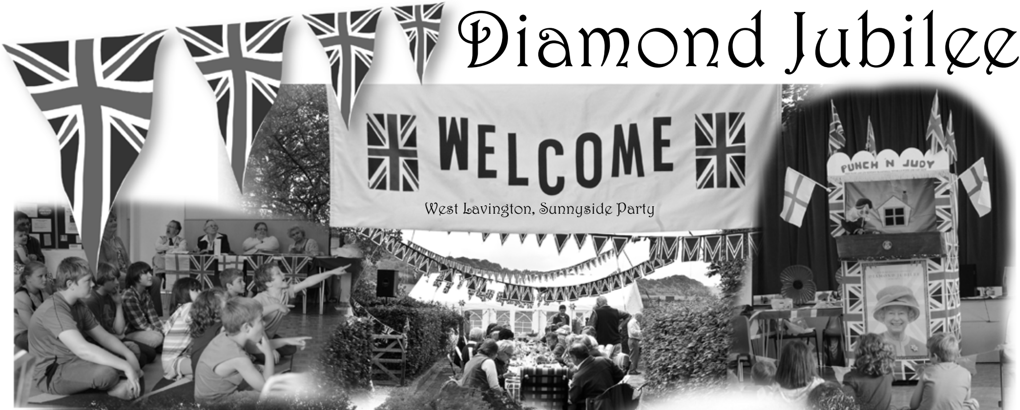
West Lavington, Sunnyside Party