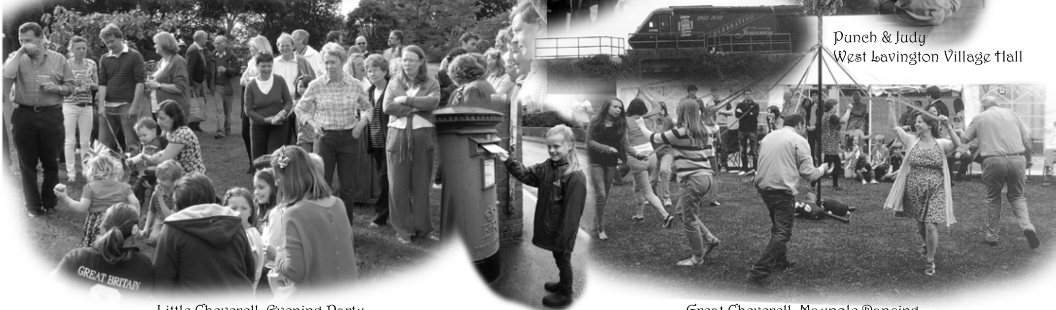
Little Cheverell, Evening Party