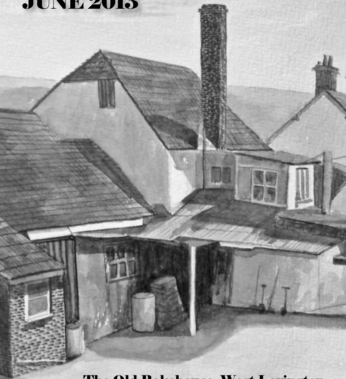
The Old Bakehouse, West Lavington