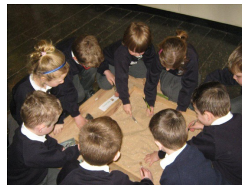
Hunting for Fossils at Devizes museum

The youngest children in our school have had a wonderful term of learning about dinosaurs. A life-sized model of a Minmi (an Ankylosaur) was made in their classroom, they had a trip to Devizes Museum where they had fun with fossils and other wonderful artefacts and they had a trip to the library. As part of their work on helping people less fortunate than themselves, they also held a sponsored fun run for Sports relief and raised over £600 for this cause! It was lovely to see them running for a kilometre around our field to achieve this immense target.