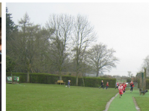
Running for Sports Relief

We enjoy joining with our local congregations to share worship sometimes and this term we went to the Mothers' Day service at St Peter's in Great Cheverell. Our children did some of the readings and prayers, lit candles and handed out flowers to all the mothers in the church – it was a lovely service. Holy Trinity has purchased the Mobile Classroom on our site after the closure of the Preschool. We shall use it for Art, Design and Technology, Music and other learning experiences that demand more space than our classrooms can easily provide. Projects can be left out to dry or to be worked on the following day without disrupting other learning in the school. We have decided to designate the classroom as "The Art Centre". We were very grateful for donations from Great Cheverell Parish Council and the Soap Box Derby Committee which helped us transform the room and its grounds into a wonderful learning space for children in primary school.