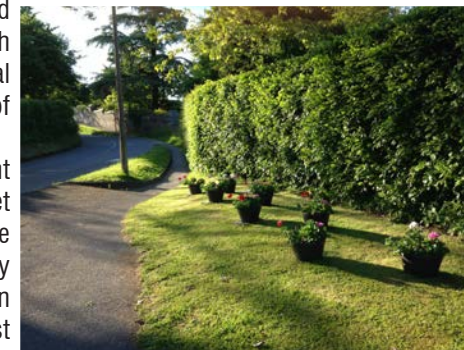
Before the theft-when originally planted

Winter planting will soon get underway. Next year, the aim is for more flowers and bus shelter art.